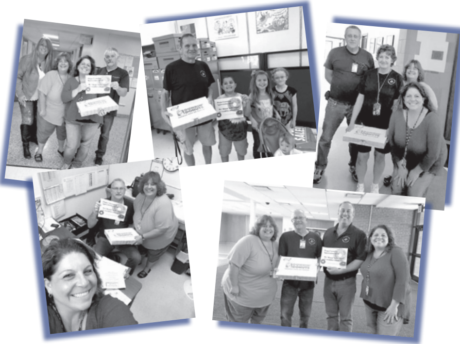
"We donut know what we would do without you"